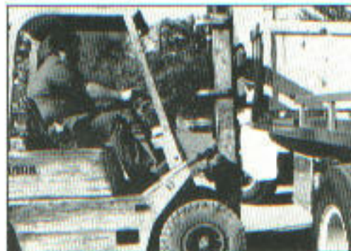
Simple cargo loading as an added benefit