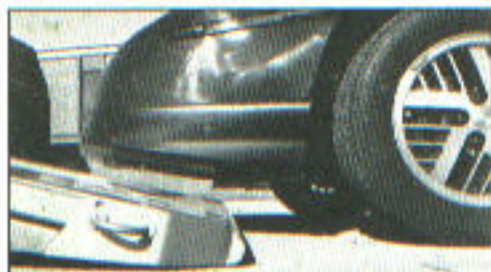
Low load angle to accommodate today's wide range of vehicles

Operator's convenience package - includes "Y" loading strap, cable keeper, remote throttle control, switch panel, and two load binders. Towing hitch with hydraulic extension, 2,000 lbs. rating (includes two hook-up chains and two safety chains) Tow sling for hitch Cable roller guide Control hand shrouds Toolbox, fits left or right side "Y" loading chain Light bar Light mounting rack Headboard for cargo carrying Full range of lights, chains, snatch blocks, etc. Fully hydraulic, independent wheel lift, equipped with 3,000 lbs. Pro-Lift wheel attachment. (Chassis rating is a minimum 20,000 GVW for wheel lift applications.)