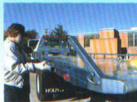
Retractable, self-storing side rails (Patent Pending)