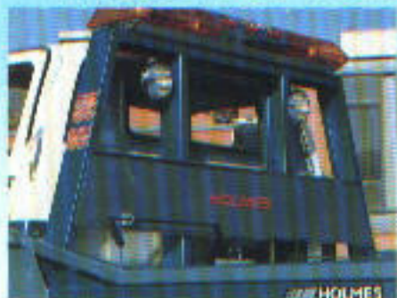
Distinctively styled light bar with high rearview visibility