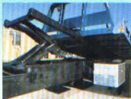
Scissor hoist simplifies mounting; increases load stability